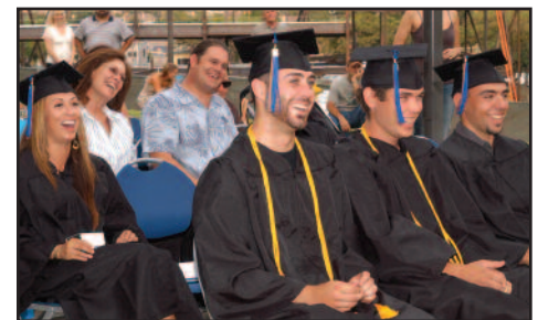
Ford ASSET graduation ceremony, 2006

As the only one of its kind in the county, the Ford Automotive Student Service Education Training program draws students from throughout the region. Students earn between $6-$8 an hour while undergoing the training, but typically make between $35,000 and $50,000 upon completion of the program. According to U.S. Department of Labor's Bureau of Labor Statistics, many master technicians earn from $70,000 to $100,000 annually because of commissions.