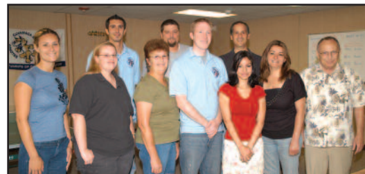
Associated Students of Cuyamaca College (ASCC) Officers