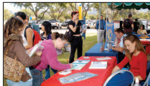
A small part of the University Transfer Fair 2006

Later in the fall semester, the ASCC was involved in making the first campus College Hour, “Let’s Get the Coyote Spirit”, a huge success. During this college hour, the San Diego Blood Mobile was on campus, and so many people were interested in donating blood that two additional nurses had to be called. There was entertainment, prizes for students and a healthy lunch provided for all who attended.