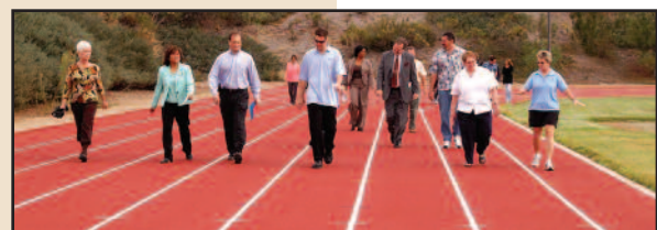
Ceremony Attendees take first lap