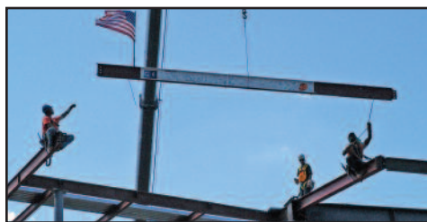
Student Center Topping Off Ceremony