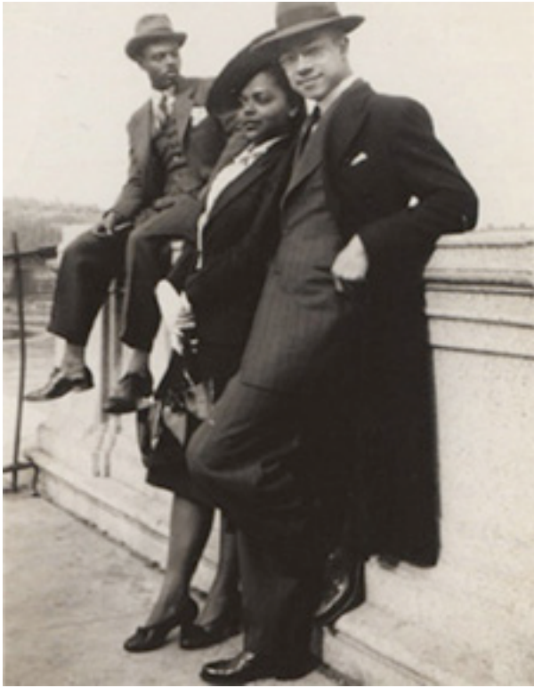
A sharp-dressed man is fine; a sharp-dressed man with a degree & options is even better.